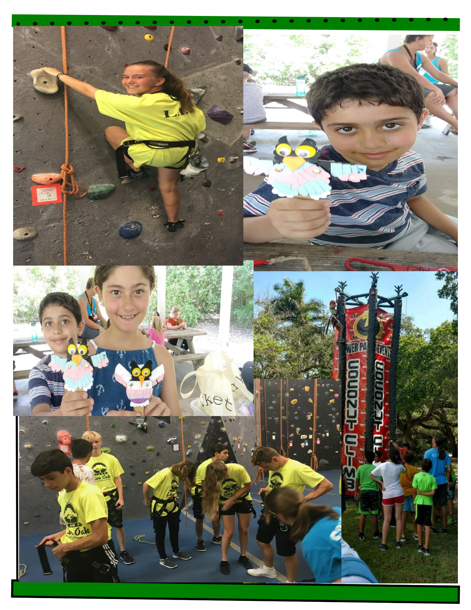
To view even more pictures, visit and follow us on Instagram and like our Facebook Page: www.facebook.com/campliveoakfl