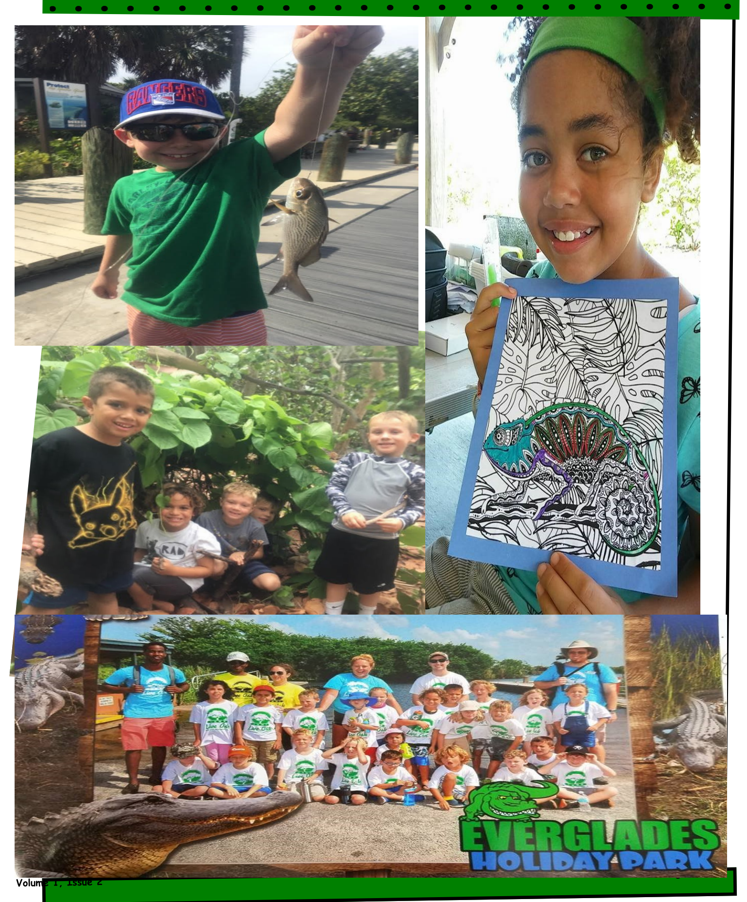
To view even more pictures, visit and follow us on Instagram and like our Facebook Page: www.facebook.com/campliveoakfl