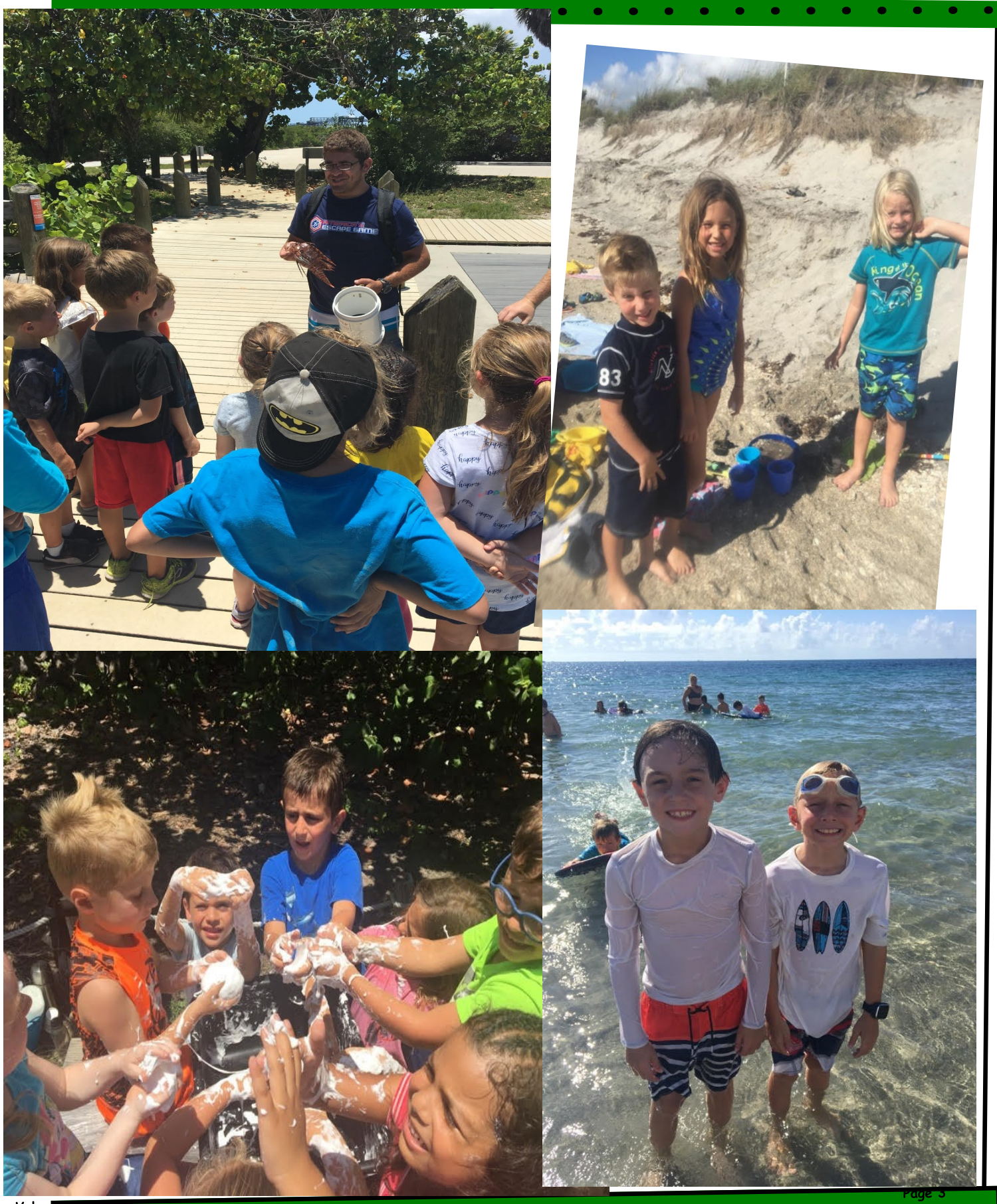
Volume 1, Issue