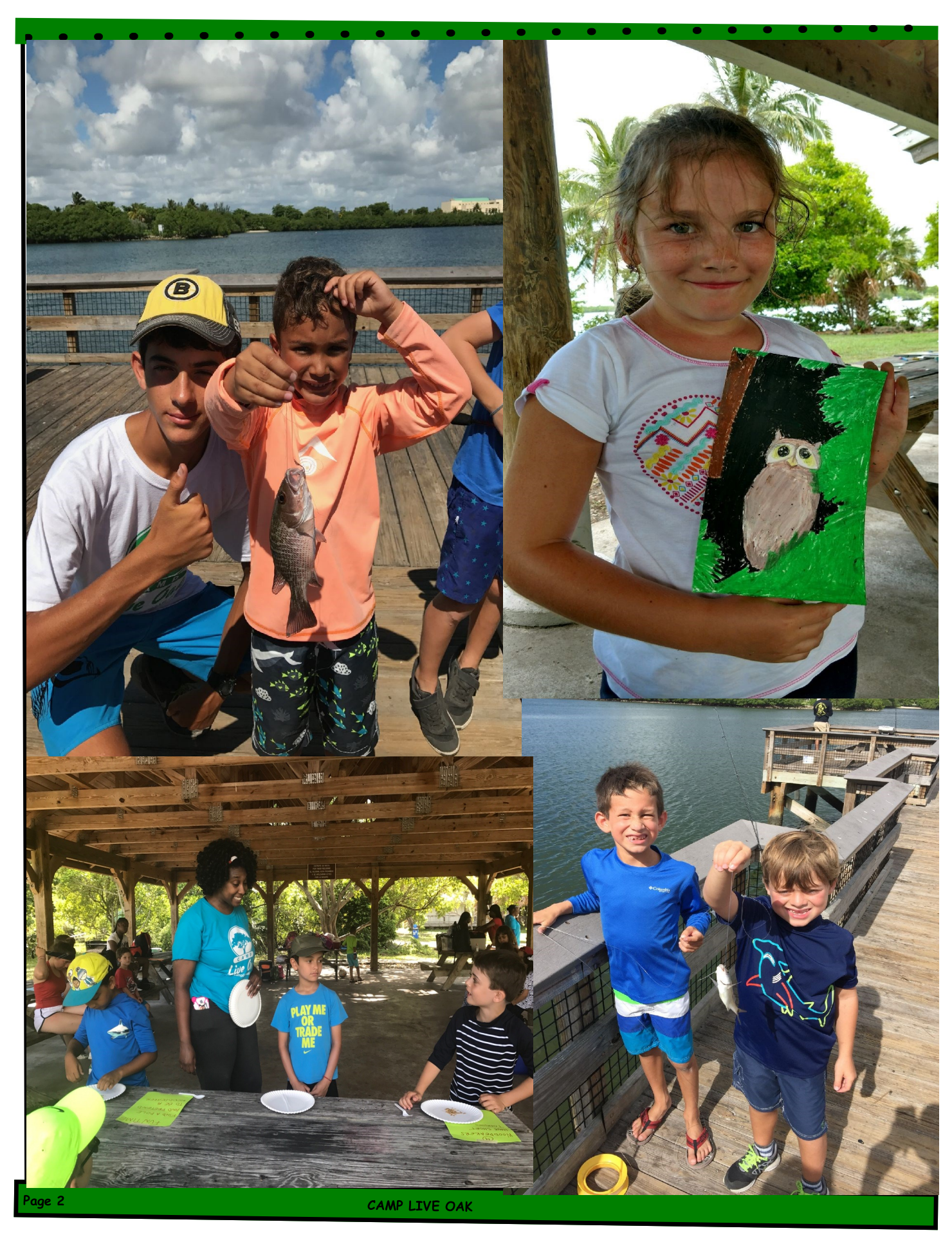
To view even more pictures, visit and follow us on Instagram and like our Facebook Page: www.facebook.com/campliveoakfl